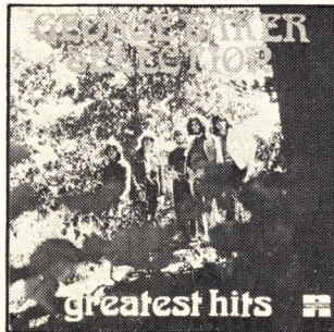
GEORGE BAKER SELECTION

Little Green Bag - Nathalie - Midnight - Mama oh mama - Dear Ann - Holy Day - Tonight e.v.a. (plus affiche)