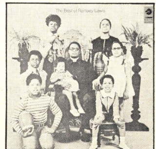
RAMSEY LEWIS TRIO „The Best of Ramsey Lewis”

Hang on sloopy - Wade in the water - Dancing in the street - The incrowd - Uptight e.v.a.