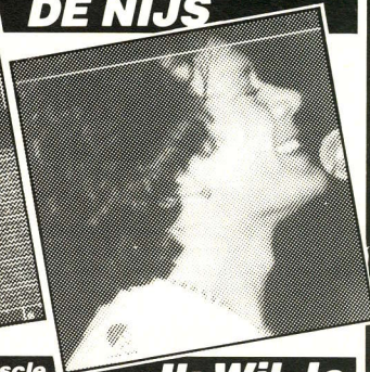
Ik Wil Je