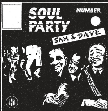
SAM & DAVE

"Soul Party" - 12 geweldige nummers: It feels so nice - No more pain - I found out - I need love - She's alright e.v.a. POP ZS 10138 (Stereo) - f 9,90