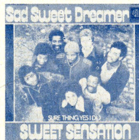
SAD SWEET DREAMER Sweet Sensation Pye-7N 45385