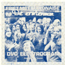
FRIET MET MAYONAISE DVO Electrogram VIP-VP 7482