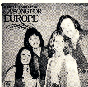
SAVE YOUR KISSES FOR ME 7N 45569