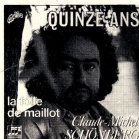
QUINZE ANS 45.X.14 056